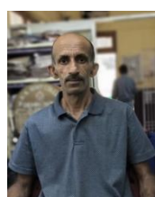
Sh. Gulshan Kumar